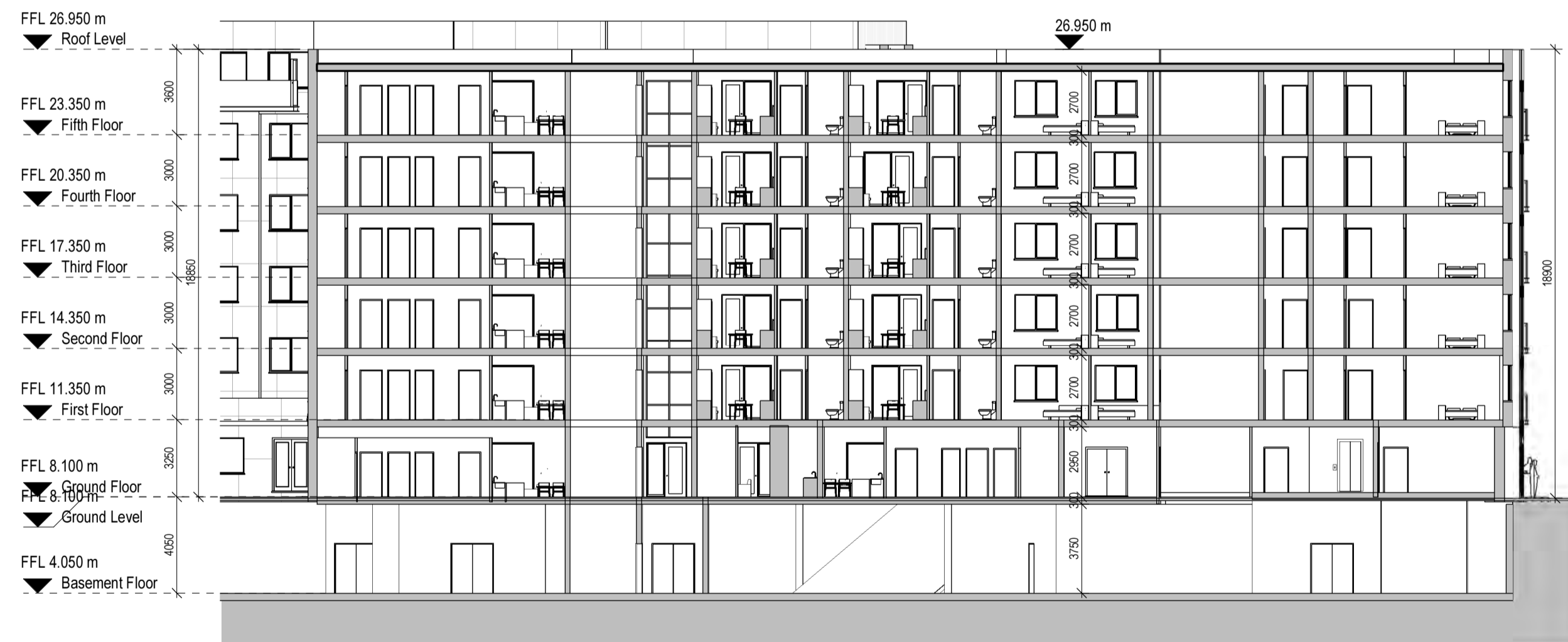
BLOCK 14A SECTION B-B Scale 1 : 200